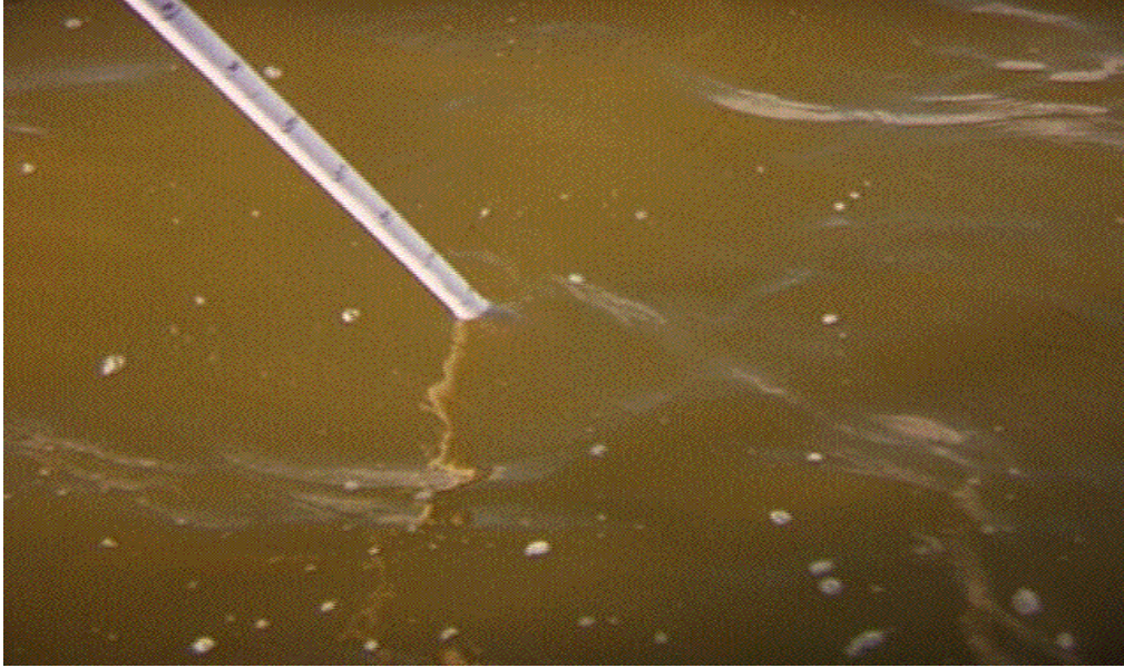
Texas Brown tide caused by Aureoumbra 3

Besides saxitoxin other algae produce a different clinical pattern: Domoic acid produced by Psuedo-Nitzischia species caused amnesic shellfish poisoning and 4 deaths on Prince William Island in Canada in 1987. Canadian authorities now monitor the levels of toxin; Ciguatera Poisoning is caused toxins produced by a number of algae species affecting human ingestion of tropical reef fish; and Diarrhea shellfish poisoning is caused by another algae toxin.